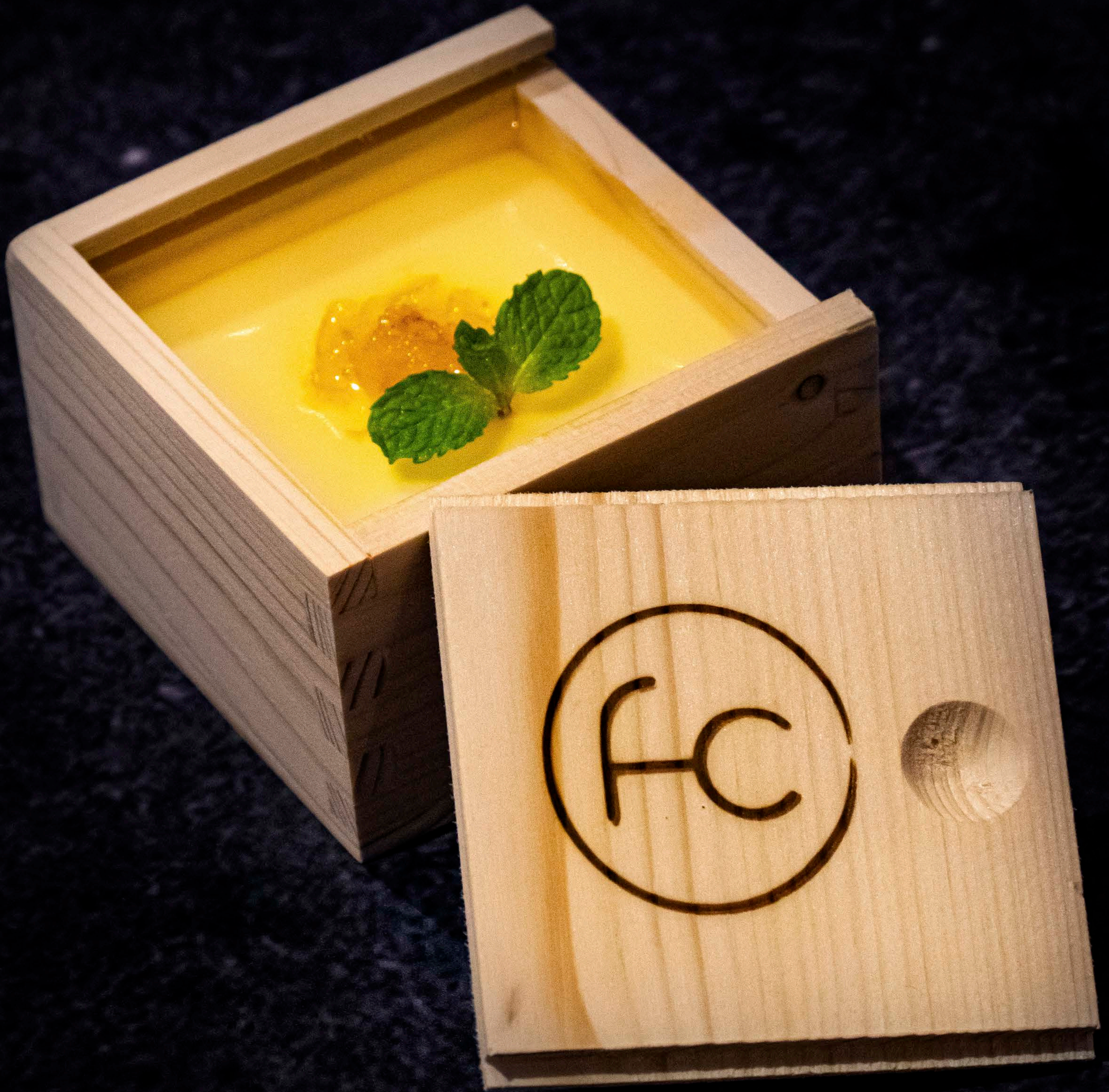
HOUSEMADE YUZU CHEESECAKE